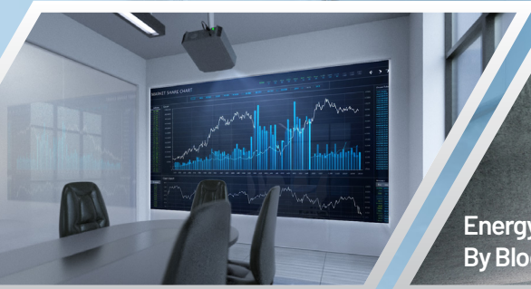
Energy Savings By Blocking IR and UV

Our Ultra Clear Smart Film minimizes glare, reflections and heat gain while ensuring pristine views, perfect for storefronts, high-rise offices, and homes with large windows.