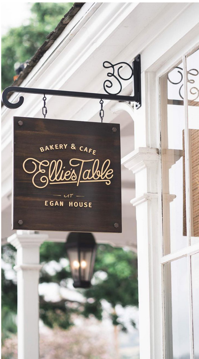
Founded in 2016 our flagship location, Ellie's Table Egan House in San Juan Capistrano