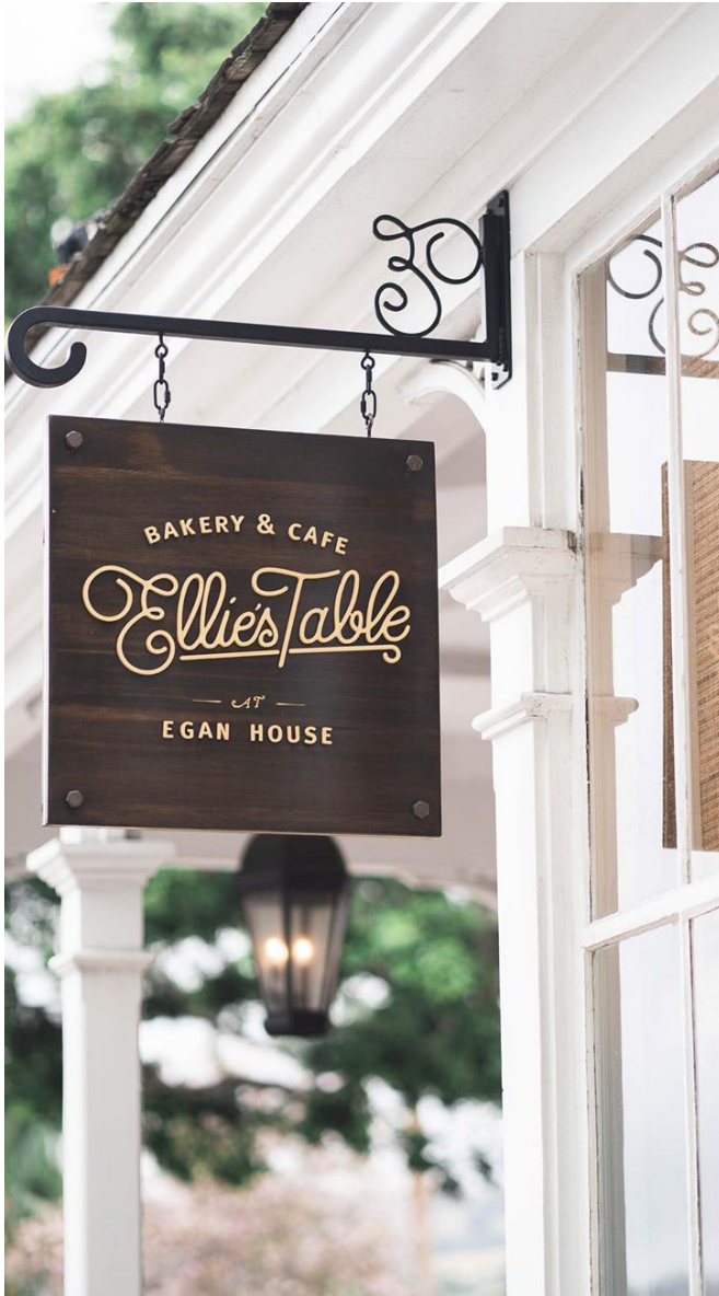
Founded in 2016 our flagship location, Ellie's Table Egan House in San Juan Capistrano