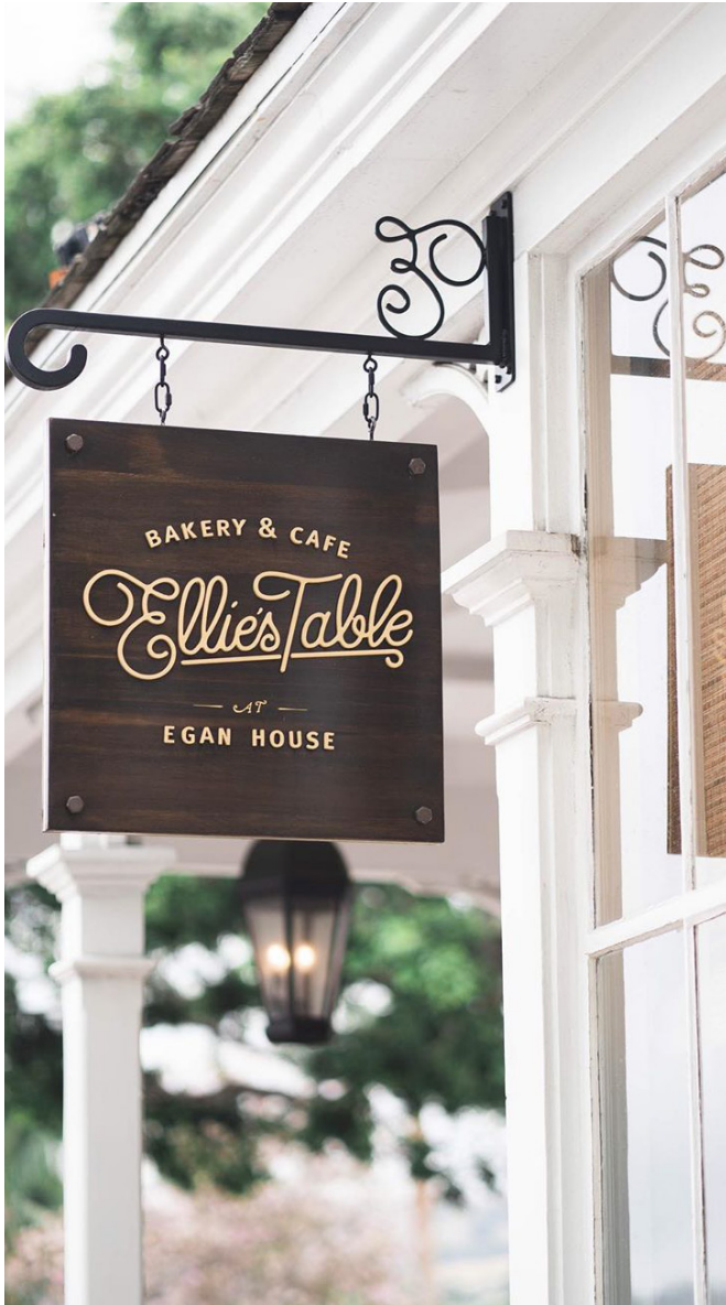
Founded in 2016 our flagship location, Ellie's Table Egan House in San Juan Capistrano