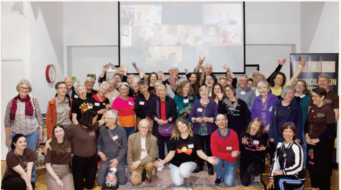
Below: LRG Forum October 2024.