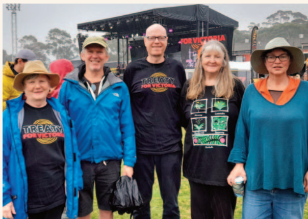
Top: New LRG – Darebin Solidarity 2024.