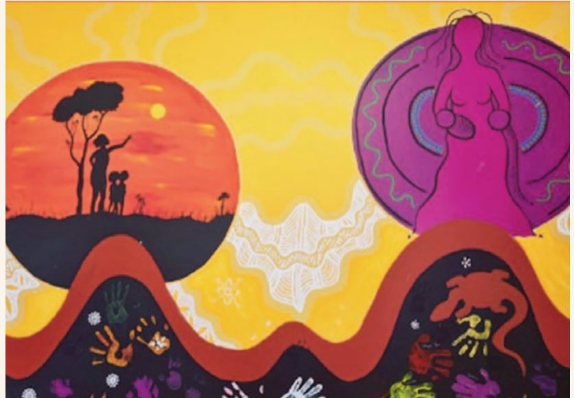
Aboriginal Gathering Place Barrbunin Beek

The objectives of the program are supporting members in progressing on their reconciliation and RAP journey, promoting respectful and meaningful relationships between First Peoples and non-Indigenous Australians and increasing the pipeline of work to certified indigenous businesses.