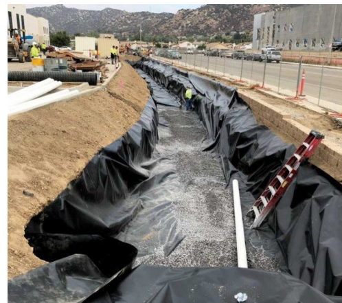
Figure 3. LLDPE lined Bioswale in California