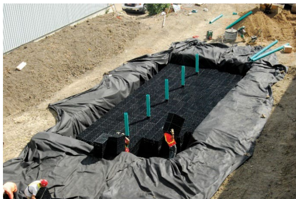
Figure 4. Underground modular stormwater tank retention system with geotextile cushion and geomembrane

Further details on flexible geomembranes products can be found on the FGI website at https://www.thefgi.org/protected/geomembrane-guide .