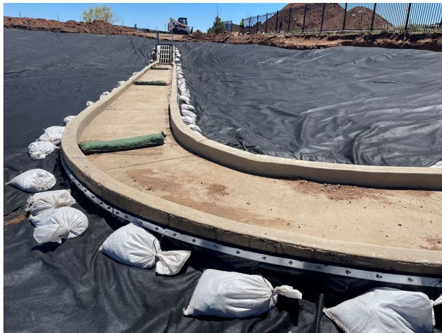
Figure 8. Stormwater dry detention system with a trickle channel in Colorado USA lined with flexible 30 mil R-LLDPE