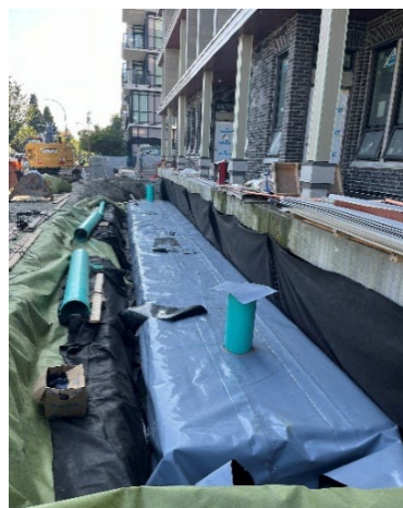
Figure 5. Geomembrane lined retention tank with 30 mil LLDPE