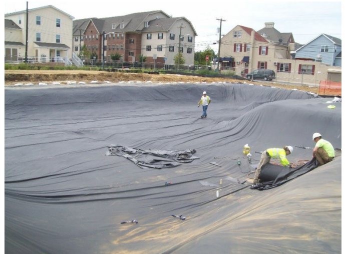
Figure 7. Stormwater detention pond lined with a flexible PVC geomembrane in Connecticut, USA