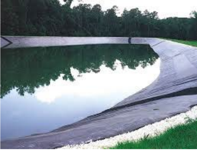
Figure 6. Stormwater retention pond lined with a flexible PVC R-EIA Geomembrane