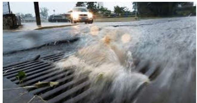
Figure 1. Photo of urban stormwater flooding

Stormwater refers to rainwater or snowmelt that flows over surfaces like streets, roofs, and landscaped areas. As it moves, it collects pollutants including oils, chemicals, nutrients, and debris. While some stormwater infiltrates into the ground to replenish aquifers or evaporates, most runoff flows untreated into storm drains and ultimately into rivers, lakes, wetlands, and oceans as shown in Figure 1 . Urban stormwater can cause serious ecological, environmental and infrastructure damage.