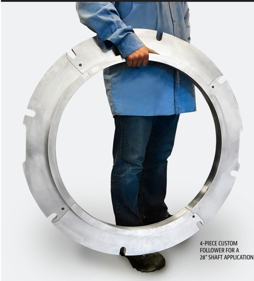
4-PIECE CUSTOM FOLLOWER FOR A 28" SHAFT APPLICATION