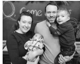
P & G—Central Asia