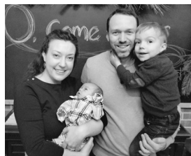
P & G—Central Asia