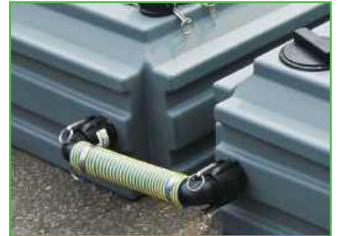
Linking kit to expand waste capacity