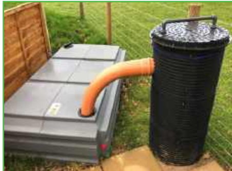
Chemiloo/Elsan® tipping point waste