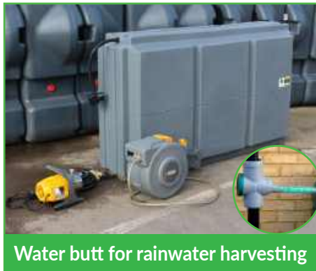
Water butt for rainwater harvesting