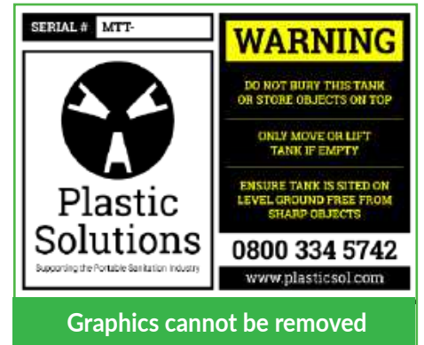
Graphics cannot be removed