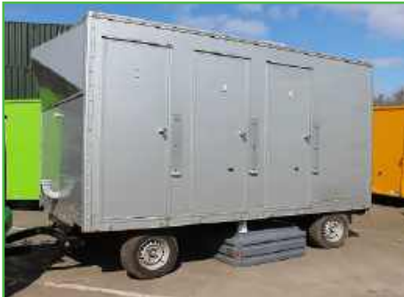
Toilet and grey water collection