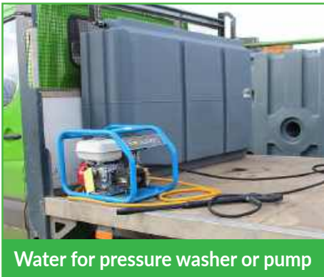
Water for pressure washer or pump