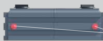
Short Side View