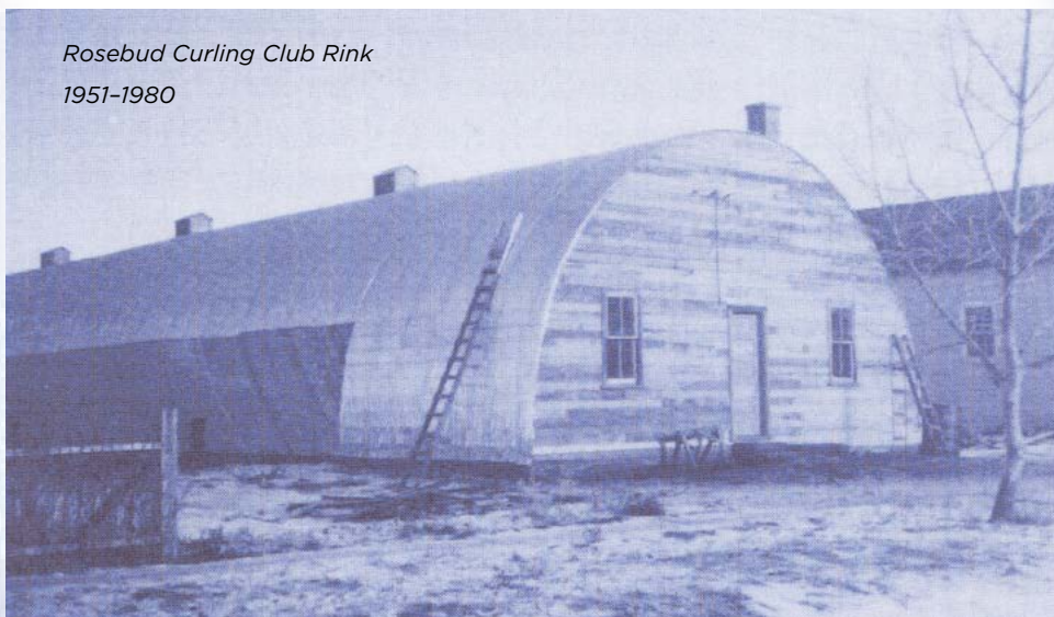
Rosebud Curling Club Rink 1951-1980