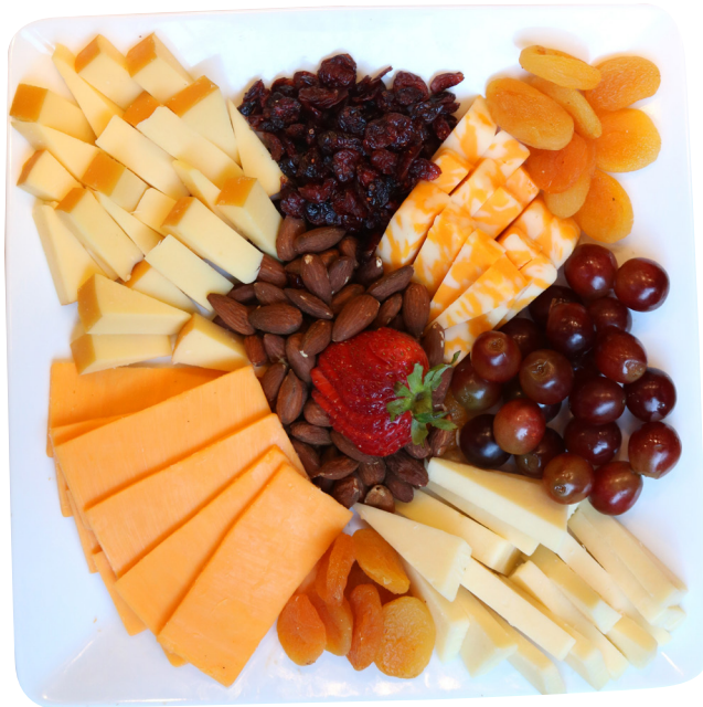
North American Artisan Cheese

Sharp wisconsin cheddar, canadian cheddar, french brie, cream havarti, imported switzerland swiss® & bold chipotle gouda cheeses paired with dried cranberries, dried apricots, walnuts, fresh fruit and artisanal crackers