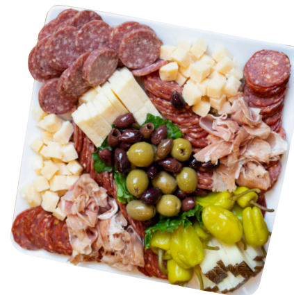
Old World Charcuterie & Cheese