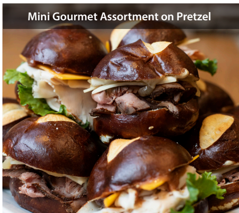
Mini Gourmet Assortment on Pretzel