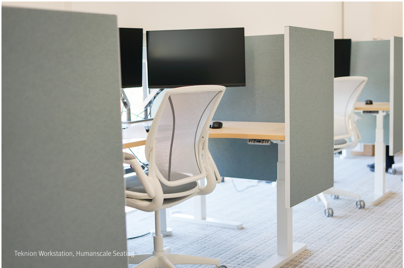
Teknion Workstation, Humanscale Seating