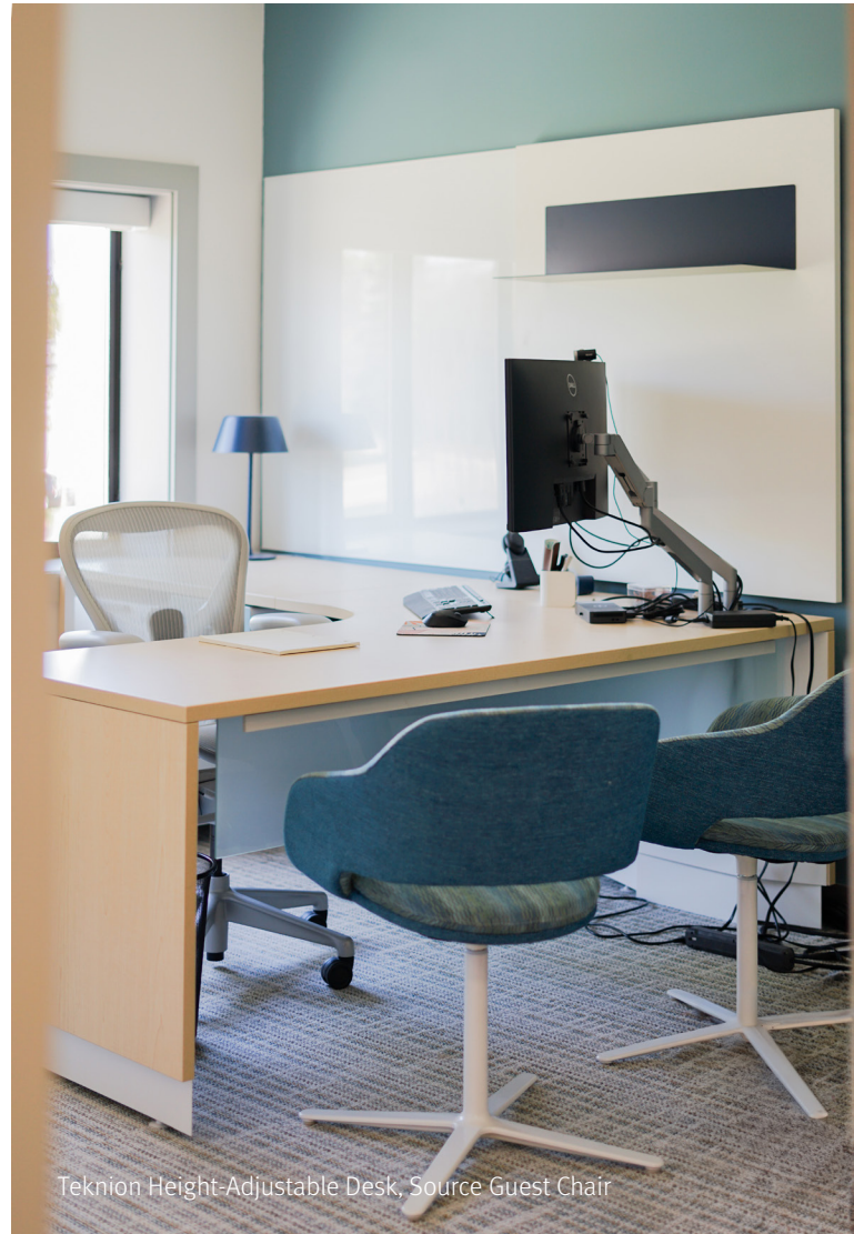
Teknion Height-Adjustable Desk, Source Guest Chair