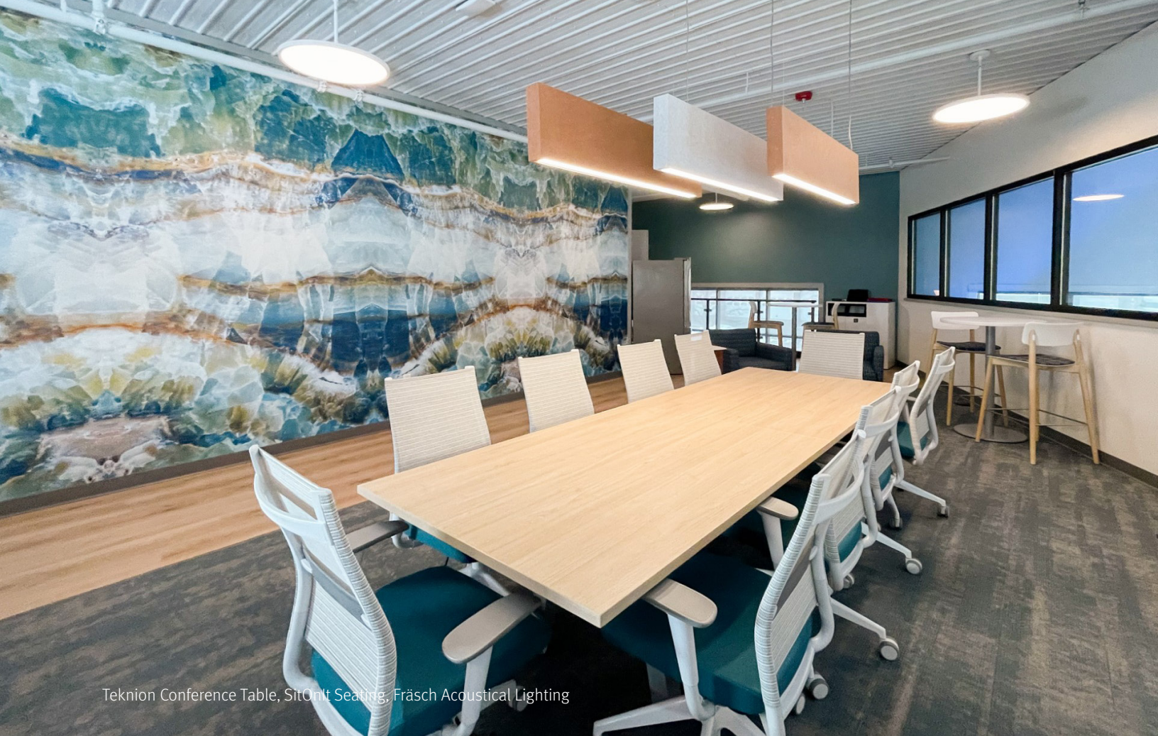
Teknion Conference Table, SitOnIt Seating, Fräsch Acoustical Lighting