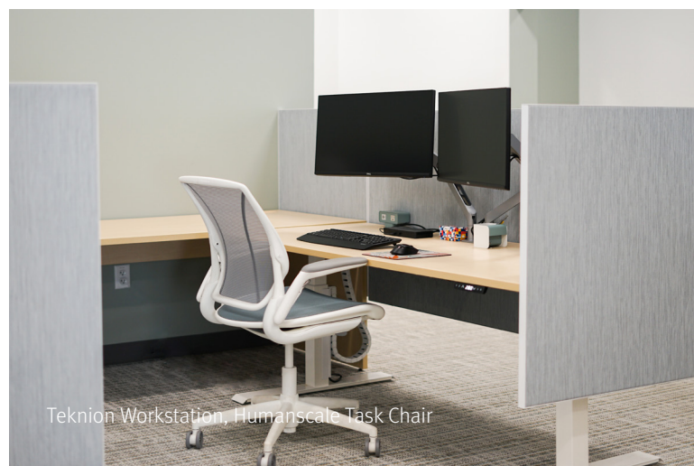
Teknion Workstation, Humanscale Task Chair