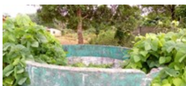
Prince Alfred Road