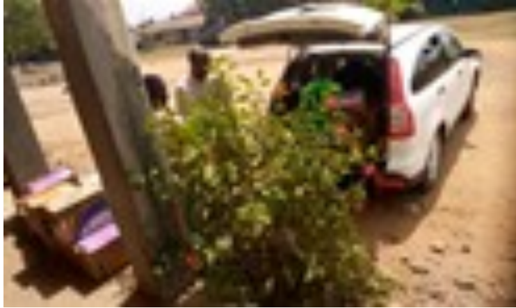
Unloading the books