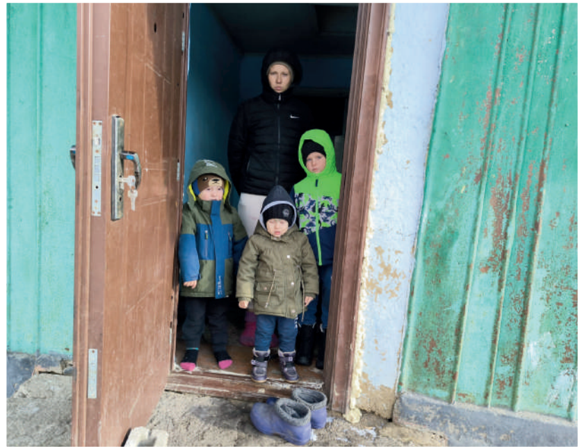
It's sad that always we are used to see the children jumping and happy, but not when outside and inside it's cold.

While many children are happy to receive toys as gifts,