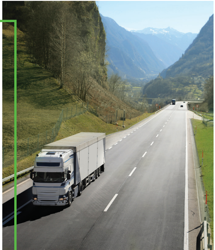
Long Life Asset Trackers

Asset tracking is the collection of real-time data from your equipment and vehicles. It is obtained using GPS trackers, barcodes, QR codes, or scanners. You can track all kinds of data such as location, hours of service, idle time, and even more data that you may need to know about your fleet to make important decisions day to day and over time. For this reason, asset tracking is vital to your fleet's operations. Businesses have been tracking their assets for as long as fleets have existed, although they did it manually in the old days. Nowadays, we have a much easier way to do it, using electronic tracking devices and databases that fleet managers can view at any time. This chapter will discuss how asset tracking works and its benefits for your fleet.