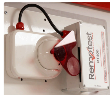
Remotest™ RT100 in test-mode