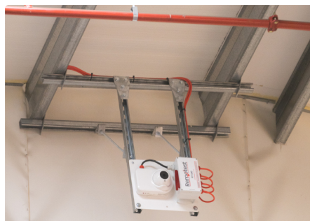
Typical Remotest™ RT100 installation