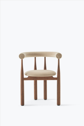
Item No: 41850 Variant: Walnut