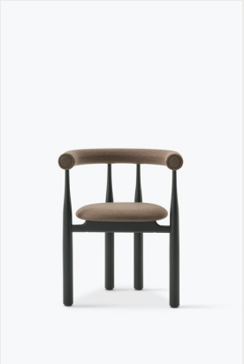
Item No: 41851 Variant: Black