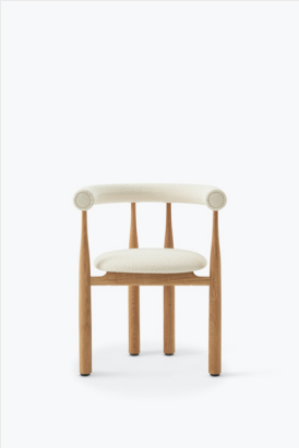
Item No: 41852 Variant: Oak

Refer to the pricelist for quickship and made-to-order options.