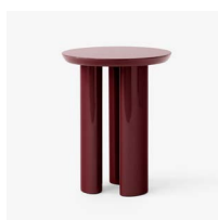
→ Burgundy Red