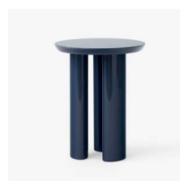
→ Steel Blue