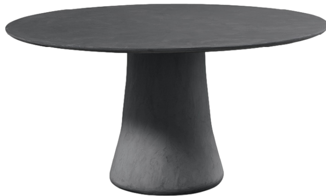
MAE / TABLE, Marco Acerbis

The Mae table, designed by Marco Acerbis, brings the sculptural elegance of the Noa collection indoors. Featuring a tapered conical base and a refined hand-applied lime-clay finish, it is available in oval and round versions. The MDF top combines aesthetics and functionality, making Mae a perfect balance of design and craftsmanship.