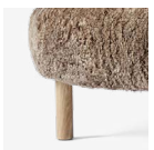
→ Sahara & Oak