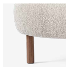
Karakorum 003 & Walnut