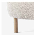
Karakorum 003 & Oak