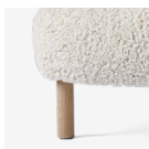
→ Moonlight & Oak