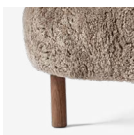
→ Sahara & Walnut