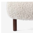
→ Moonlight & Walnut