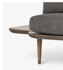
→ Smoked Oiled Oak w. Hot Madison 093