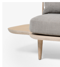
→ Oiled Oak w. Hot Madison 094