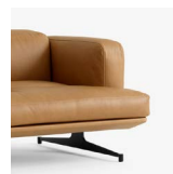
→ Noble Cognac leather