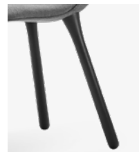
Black Lacquered Oak (RAL 9005)