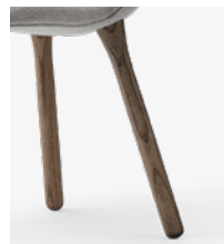
Smoked Oiled Oak