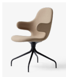
Black Powder Coating (RAL 9005)