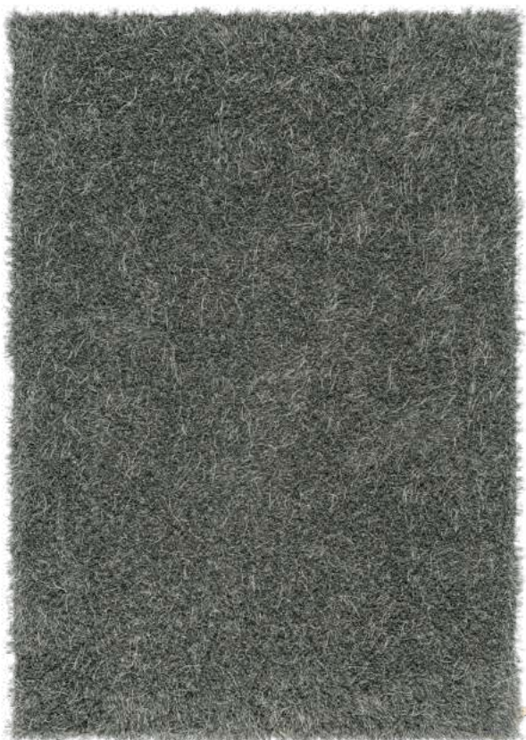
Rug 170x240 cm, Nickel Grey 502