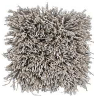
Silver Grey 500