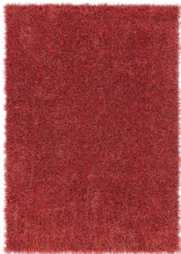
Rug 170x240 cm, Deep Coral 100