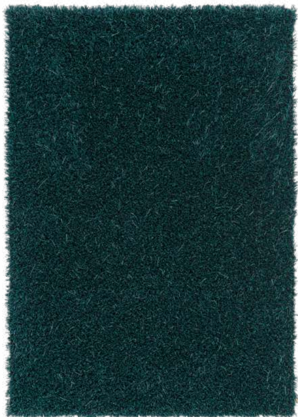
Rug 170x240 cm, Dark Turquoise 201

Design GUNILLA LAGERHEM ULLBERG Hand tufted rug in pure wool and linen