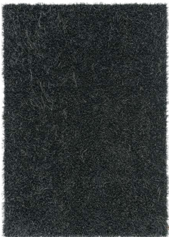
Rug 170x240 cm, Blue Iron 501