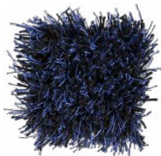
Brilliant Blue 250