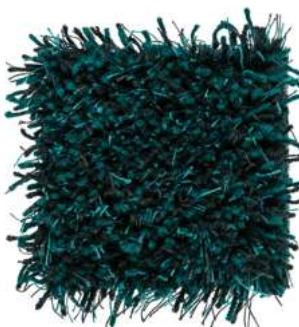
Dark Turquoise 300