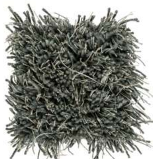
Nickel Grey 502