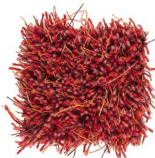
Deep Coral 100