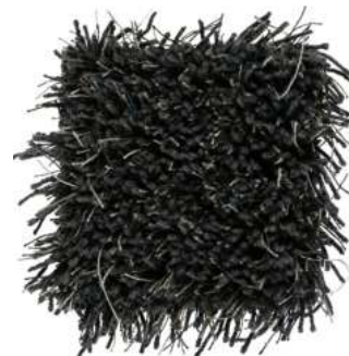
Blue Iron 501