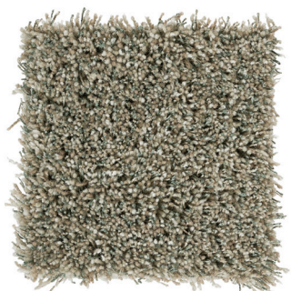
Silent Grey 803