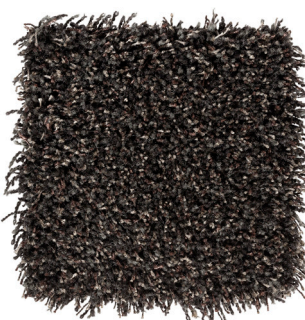
Black Bean 504