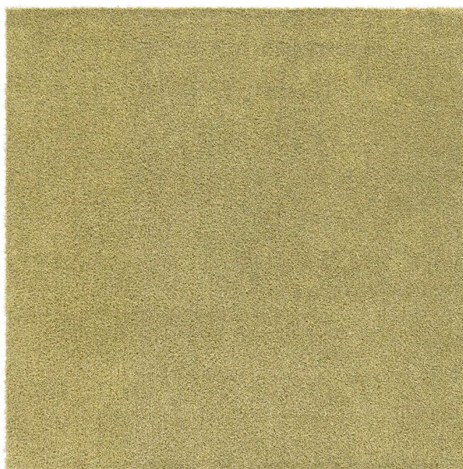
Rug 240x240 cm, Lemon & Lime 306