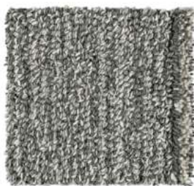
Harmonic Silver 501