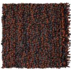
Daring Rust 700