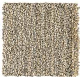
Quiet Beige 800