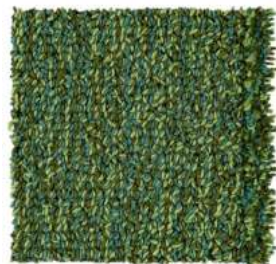
Cool Green 300