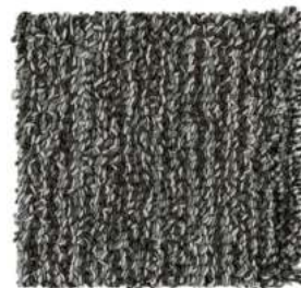
Melancholic Grey 502