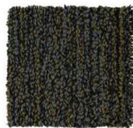
Secret Black 500