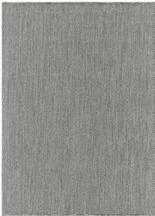
Rug 170x240 cm, Harmonic Silver 501