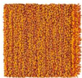
Happy Orange 400