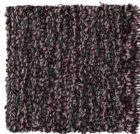
Mystic Mauve 620