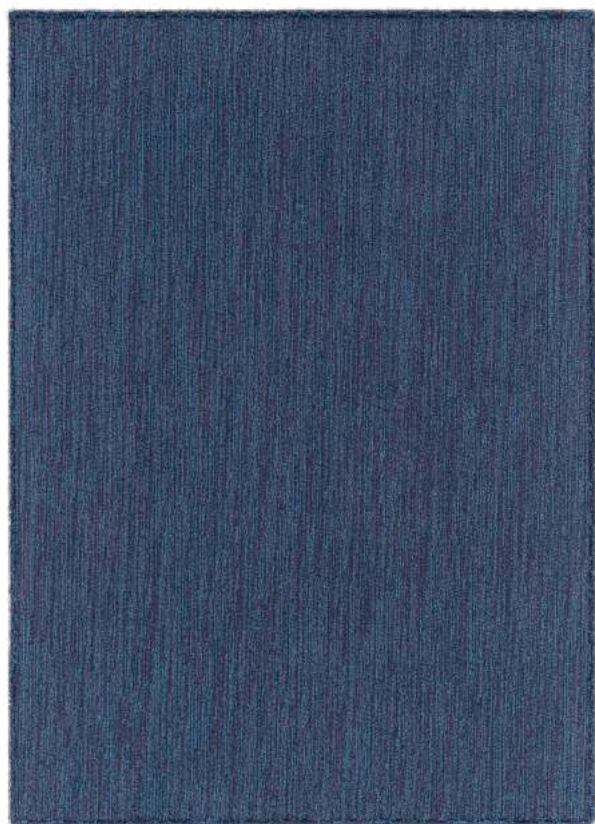
Rug 170x240 cm, Playful Purple 621