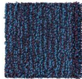
Playful Purple 621