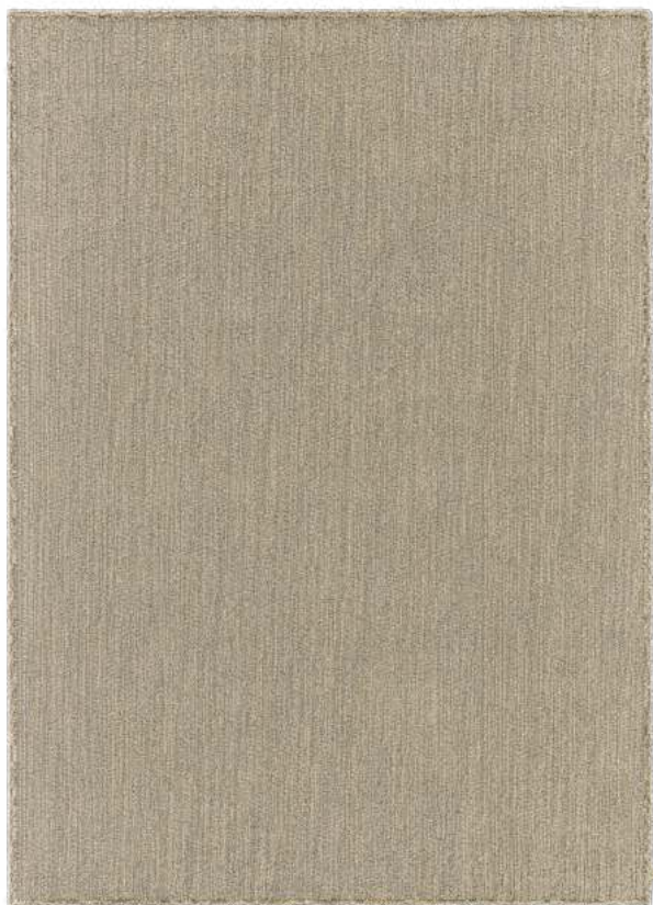
Rug 170x240 cm, Quiet Beige 800

Design KASTHALL DESIGN STUDIO Hand tufted bouclé rug in pure wool