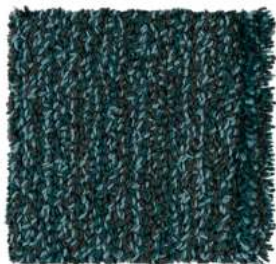
Mellow Blue 200