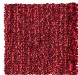
Rebellious Red 100