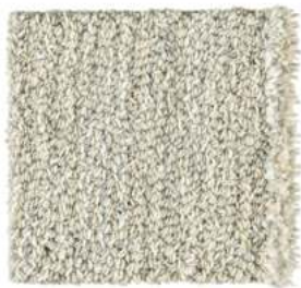
Delicate White 801

Design KASTHALL DESIGN STUDIO Hand tufted bouclé rug in pure wool