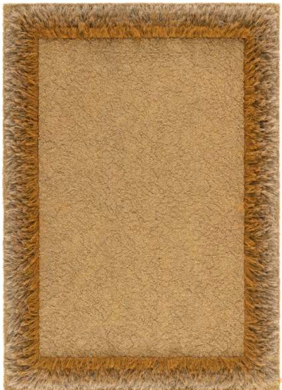
Rug 170x240 cm | Hoopoe 400

Design ELLINOR ELIASSON Hand tufted bouclé rug in pure wool and linen