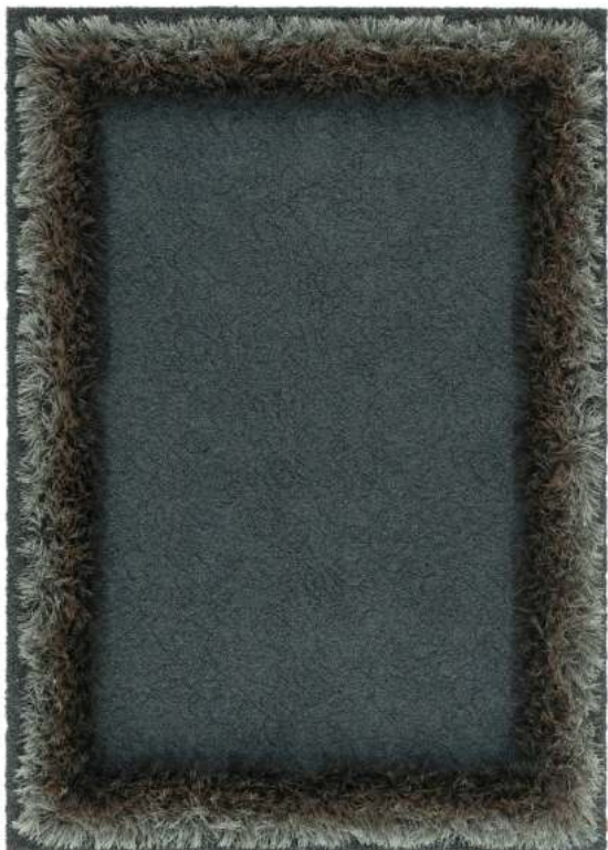
Rug 170x240 cm | Blue Jay 200

Design ELLINOR ELIASSON Hand tufted bouclé rug in pure wool and linen