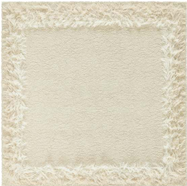
Rug 240x240 cm, Swan 801

Design ELLINOR ELIASSON Hand tufted bouclé rug in pure wool and linen