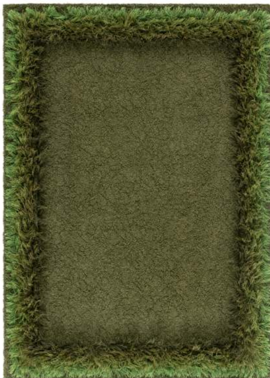
Rug 170x240 cm | Parakeet 300