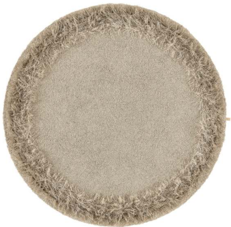
Rug round: Ø 240 cm, Heron 800