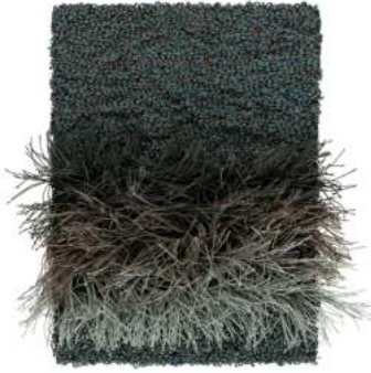
Blue Jay 200

Design ELLINOR ELIASSON Hand tufted bouclé rug in pure wool and linen