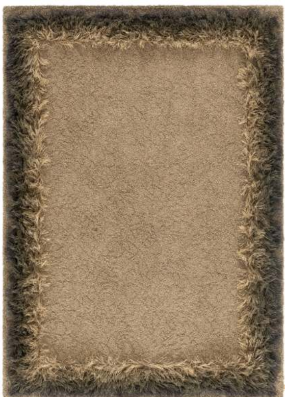
Rug 170x240 cm | Sparrow 804