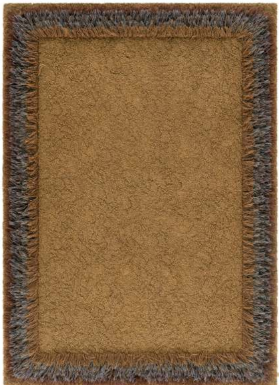
Rug 170x240 cm | Nuthatch 803