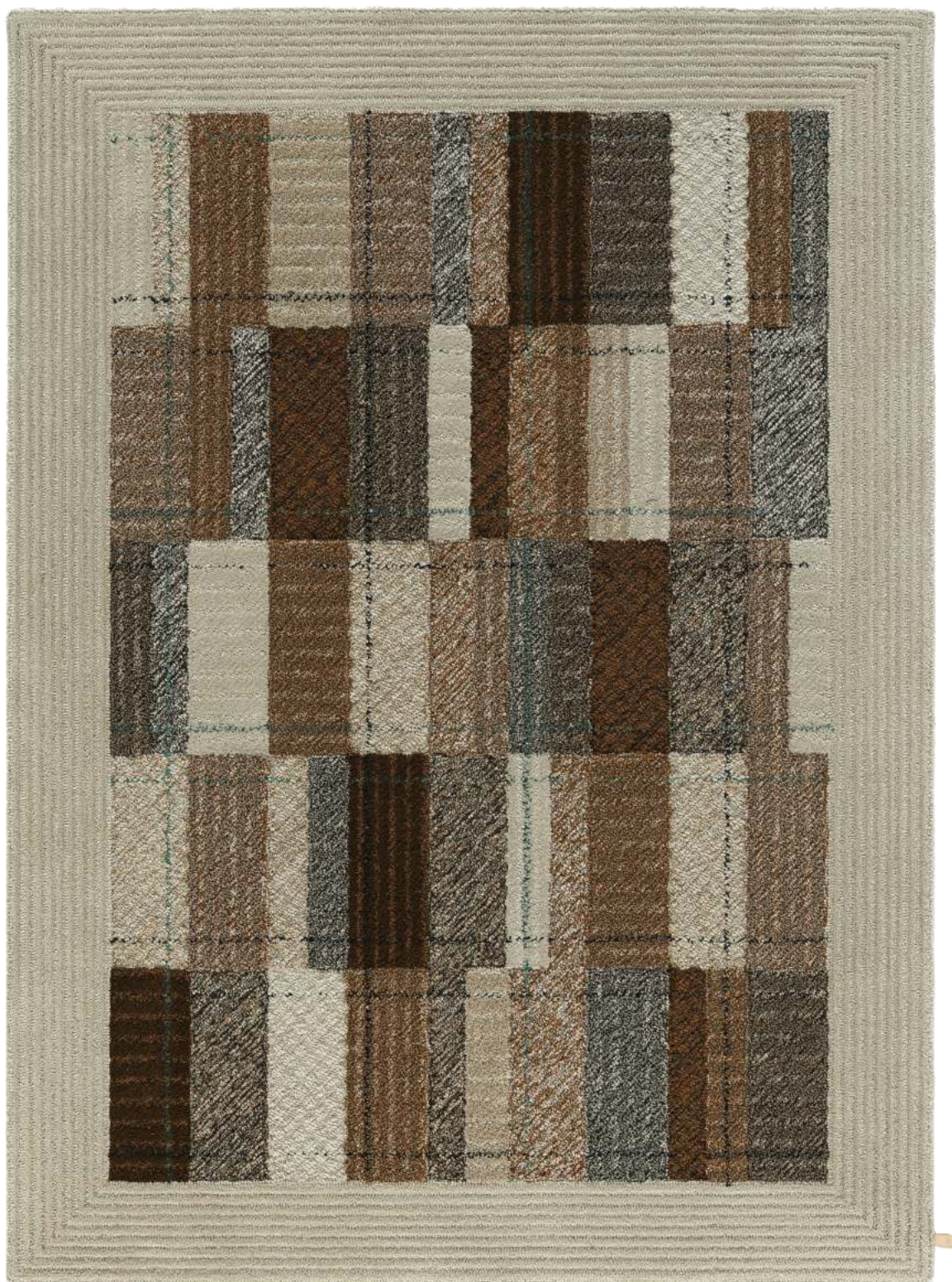
Rug 200x290 cm | Terracotta Sand 870