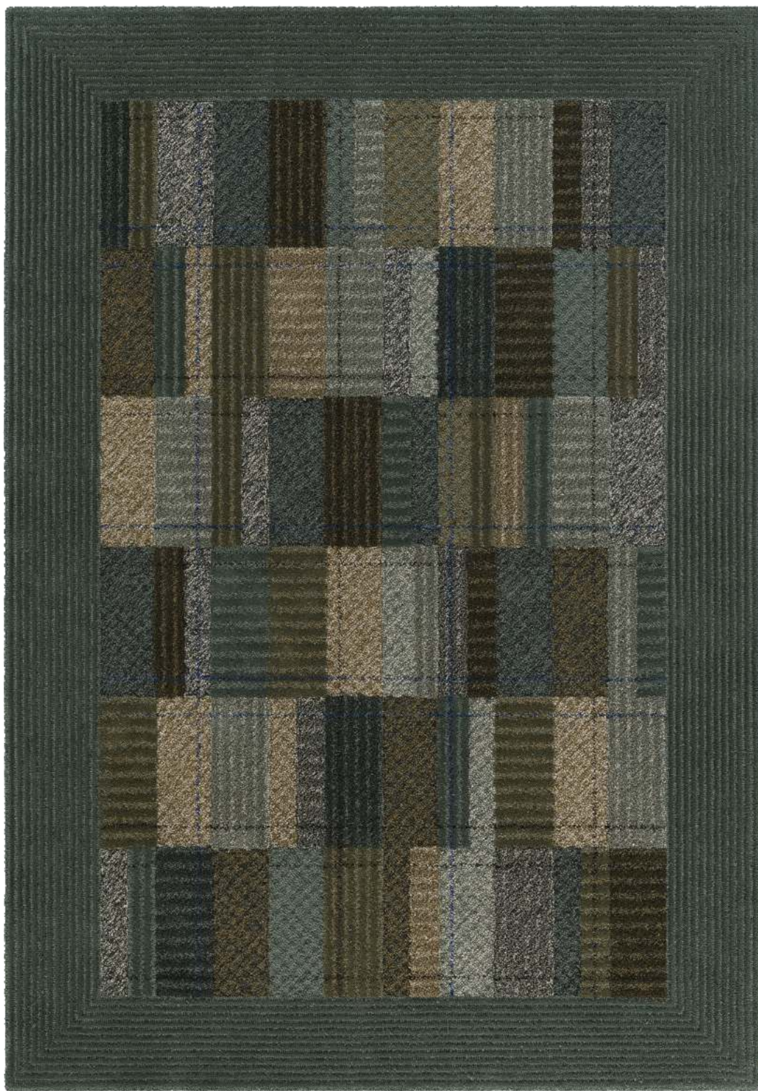
Rug 200x290 cm | Bronze Green 370

Design ELLINOR ELIASSON Hand tufted cut and bouclé rug in pure wool and linen