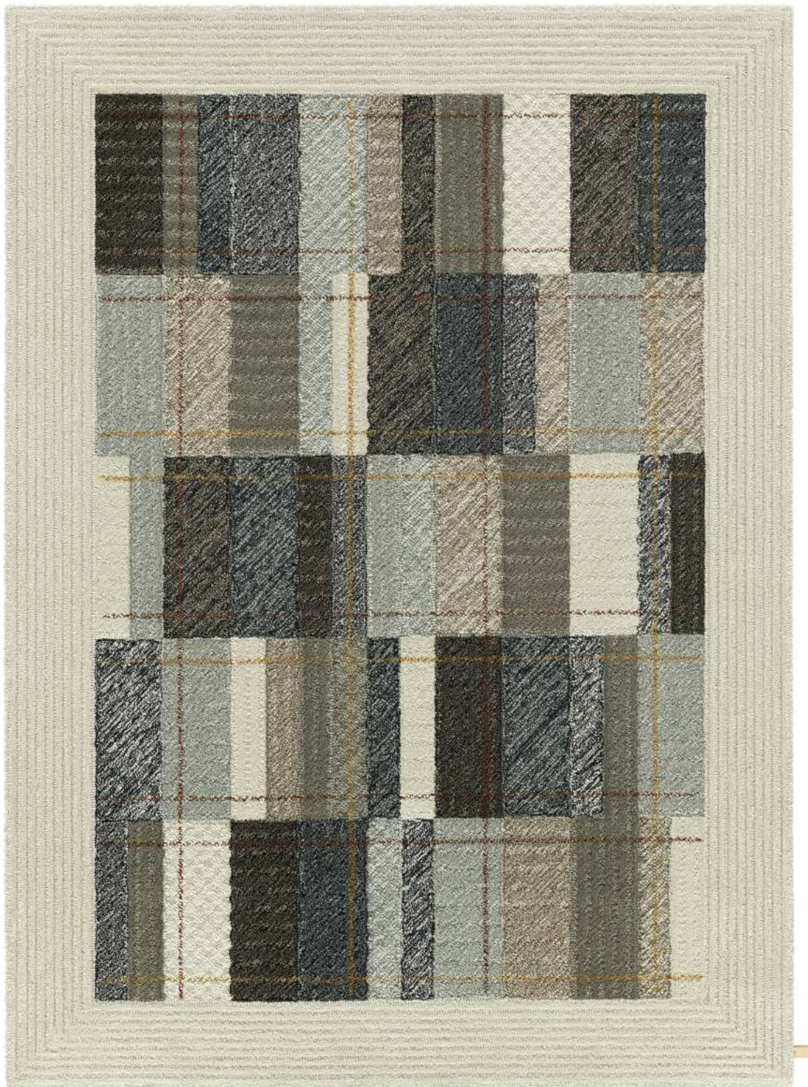
Rug 200x290 cm | Indigo Beige 820

Design ELLINOR ELIASSON Hand tufted cut and bouclé rug in pure wool and linen