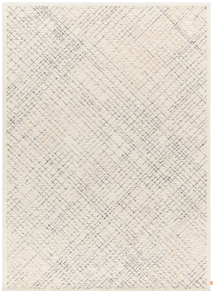
Rug 200x300 cm, White Diamond 500