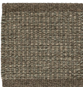
Pine Tree 880