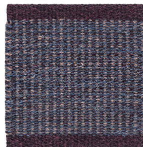
Dark Lavender 220