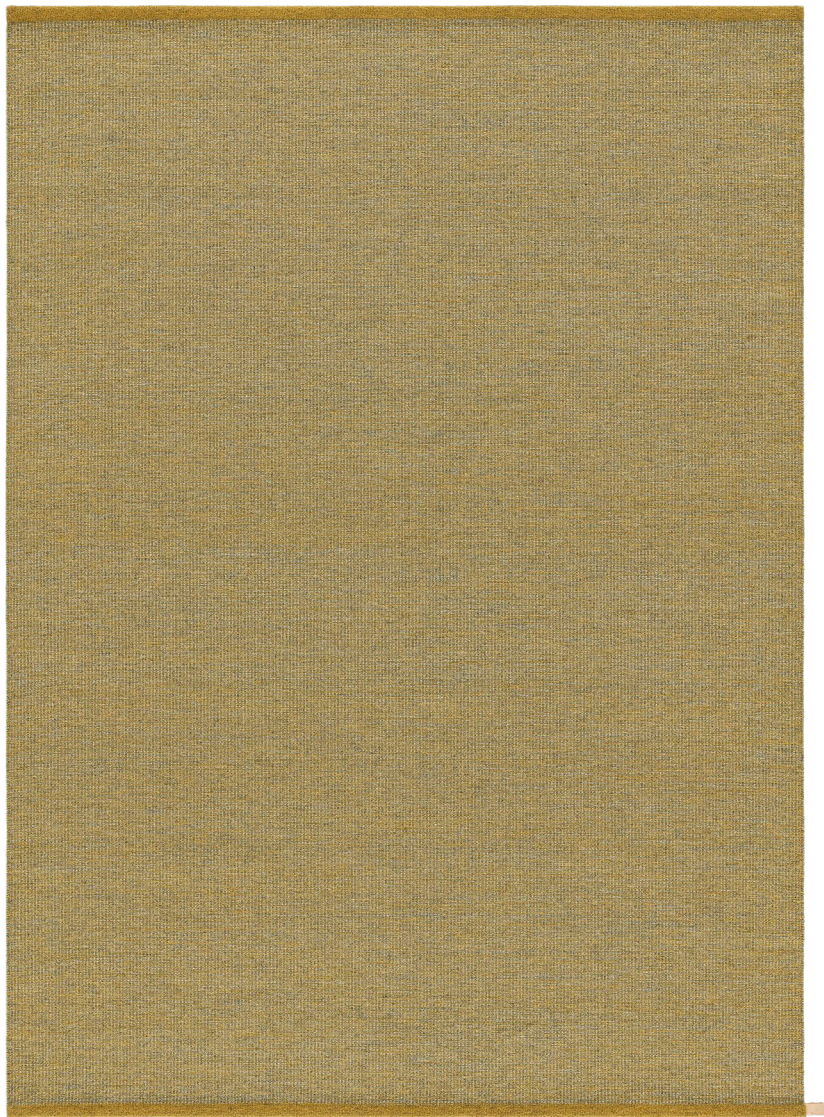
Rug 170x240 cm, Golden Ash 450

Design ELLINOR ELIASSON Woven rug in pure wool