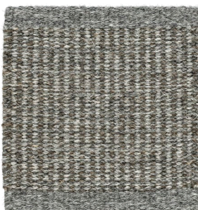
Silver Willow 551