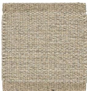
Sand Dune 882

Design ELLINOR ELIASSON Woven rug in pure wool