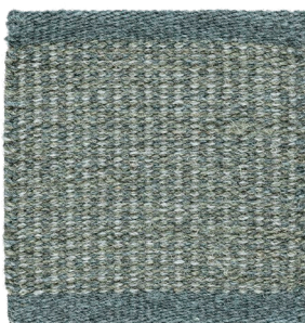
Ocean Mist 221