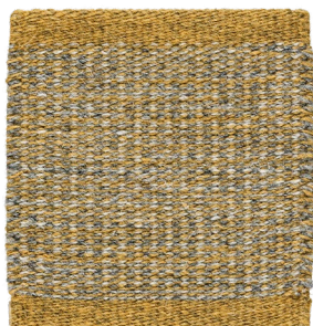
Golden Ash 450