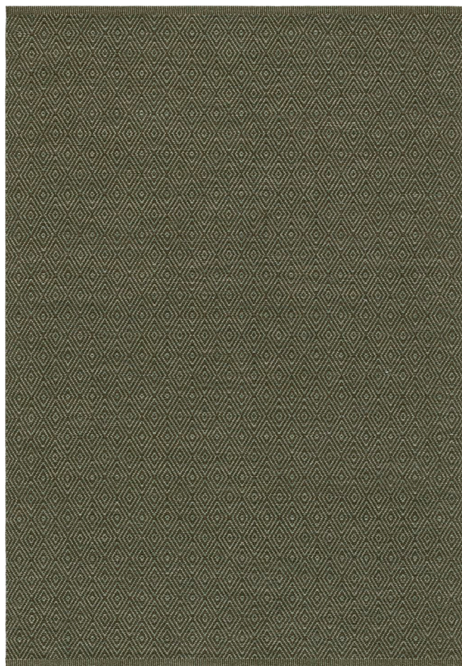
Rug 160x240 cm, Timber Green 735