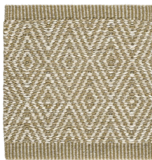
Yellow Brick 886