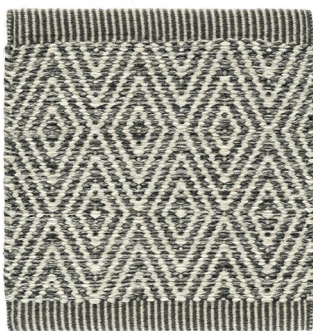
Stone Grey 580