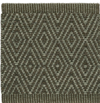
Timber Green 735