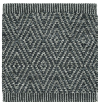
Foggy Blue 225