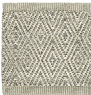
Lichen Grey 852

Design GUNILLA LAGERHEM ULLBERG Woven rug in pure wool