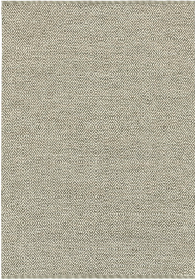
Rug 160x240 cm, Lichen Grey 852

Design GUNILLA LAGERHEM ULLBERG Woven rug in pure wool