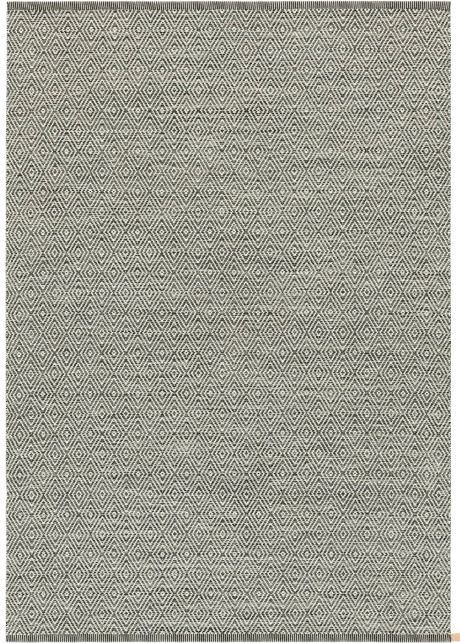
Rug 160x240 cm, Stone Grey 580