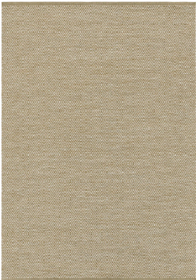
Rug 160x240 cm, Yellow Brick 886