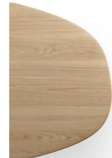
Oak, Oiled JAT3-OOL