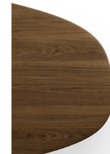
Fumed Oak, Oiled JAT3-OFU