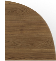
Fumed Oak, Oiled JAO6-OFU