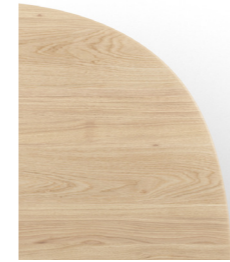
Oak, Oiled JAO6-OOL