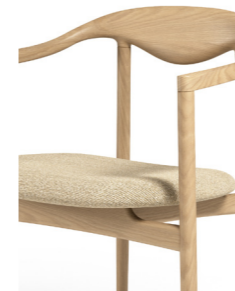
Oak, Oiled JACA-OOL