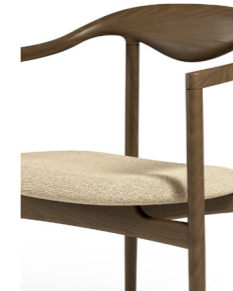
Fumed Oak, Oiled JACA-OFU