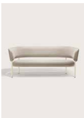
FONT LOUNGE SOFA