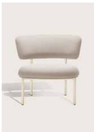
FONT LOUNGE CHAIR