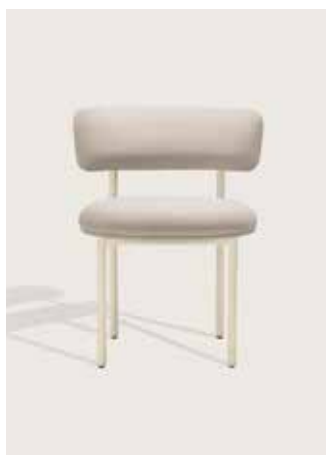
FONT DINING CHAIR