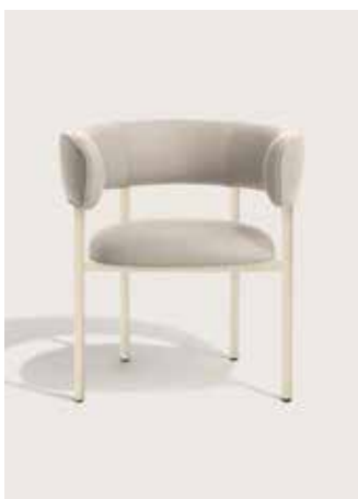
FONT DINING ARMCHAIR