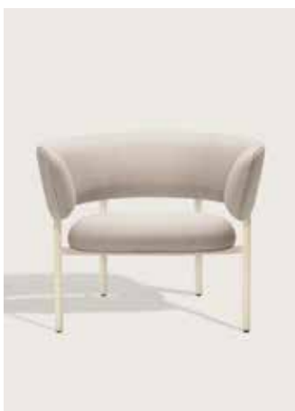
FONT LOUNGE ARMCHAIR