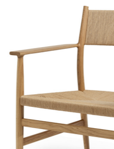
Oak, Oiled AVCL-OOL-02