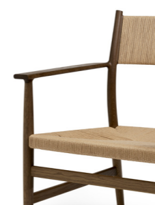
Fumed Oak, Oiled AVCL-OFU