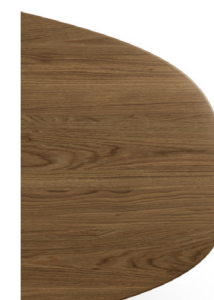
Fumed Oak, Oiled JAJ6-OFU