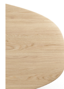
Oak, Oiled JAJ6-OOL