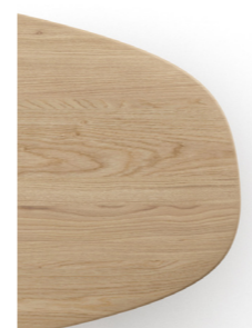
Oak, Oiled JAJ5-OOL