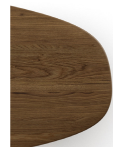
Fumed Oak, Oiled JAJ5-OFU