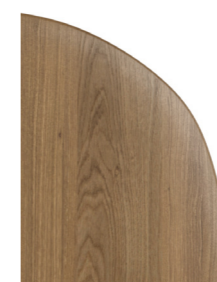
Fumed Oak, Oiled JAJ4-OFU