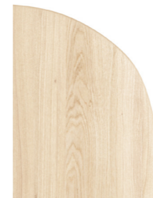
Oak, Oiled JAJ3-OOL