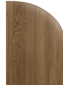
Fumed Oak, Oiled JAJ2-OFU