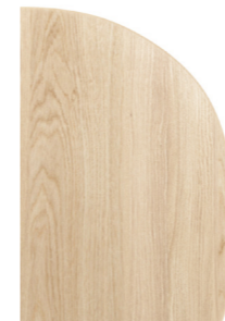
Oak, Oiled JAJ2-OOL