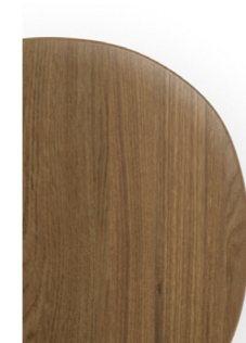
Fumed Oak, Oiled JAJ1-OFU