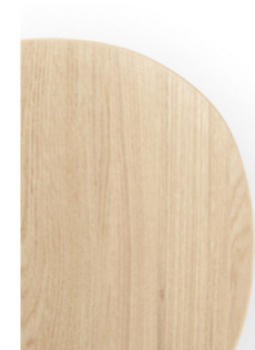
Oak, Oiled JAJ1-OOL