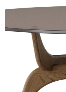
Fumed Oak, Oiled Bronze Glass TRO5-OFU-BG