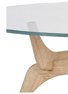
Oak, Oiled Clear Glass TRO7-OOL-CG