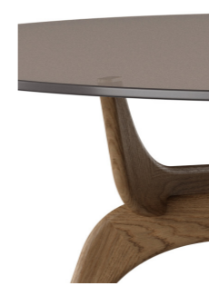
Fumed Oak, Oiled Bronze Glass TRO7-OFU-BG