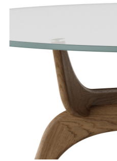
Fumed Oak, Oiled Clear Glass TRO7-OFU-CG