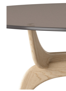
Oak, Oiled Bronze Glass TRO7-OOL-BG