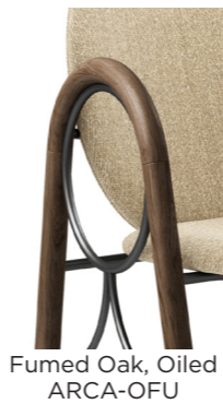
Fumed Oak, Oiled ARCA-OFU