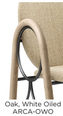
Oak, White Oiled ARCA-OWO