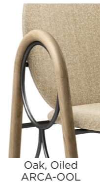
Oak, Oiled ARCA-OOL