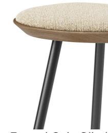
Fumed Oak, Oiled Metal Legs PA75-OFU-BM