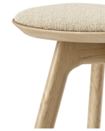
Oak, Oiled Wood legs PA75-OOL