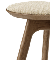
Fumed Oak, Oiled Wood legs PA75-OFU