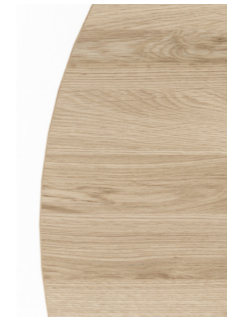
Oak, White Oiled AVO6-OWO