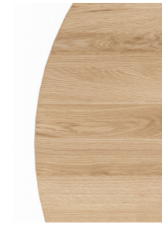
Oak, Oiled AVO6-OOL