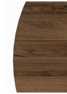
Fumed Oak, Oiled AVO6-OFU