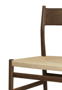
Fumed Oak, Oiled AVCX-OFU-01