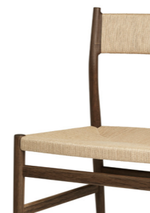
Fumed Oak, Oiled AVCX-OFU-02