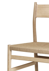
Oak, White Oiled AVCX-OWO